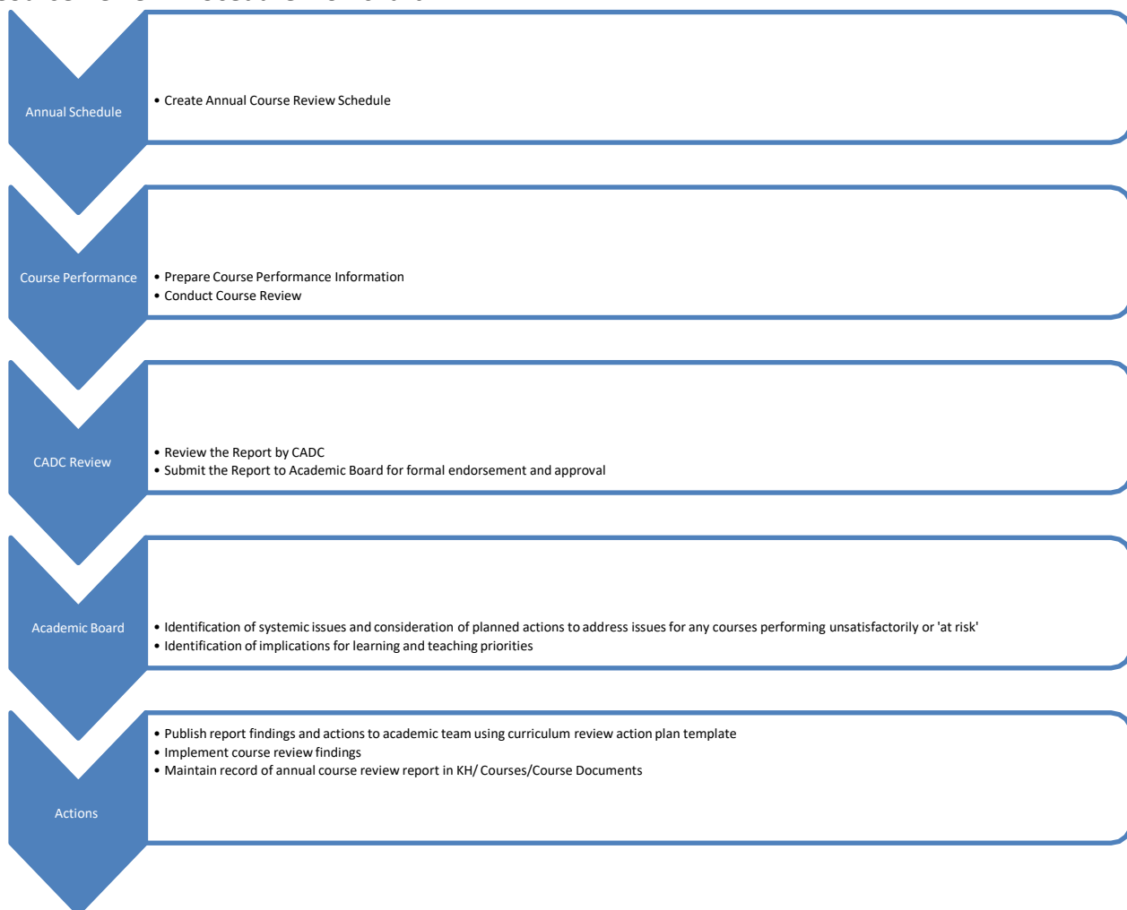
Figure 1: Course Review Process